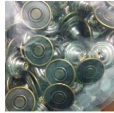
Metal Shank Button