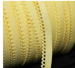
Picot Elastic & Lace