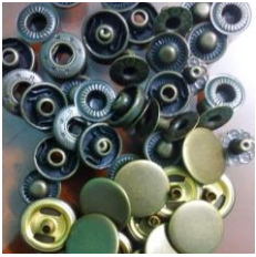
Metal Snap Button