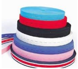
Knit & Hole Elastic