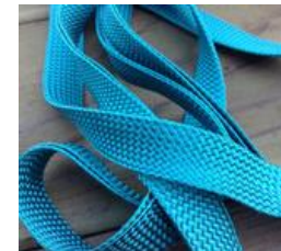
Tube & Flat Drawstring